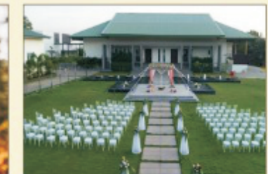
MARRIAGE DESTINATION HALL