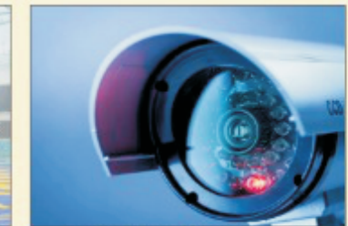
24/7 SECURITY WITH CCTV