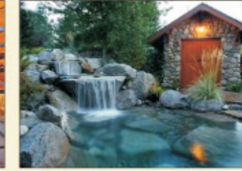
NATURE SWIMMING POOL