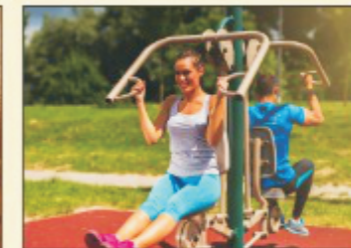
OPEN AIR GYM