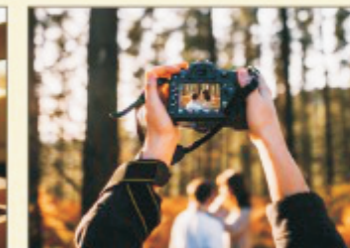
PHOTO SHOOT ZONE