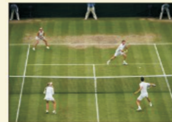
INDOOR / OUTDOOR GAMES