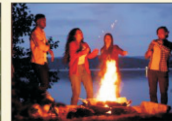
FIRE CAMP ZONE