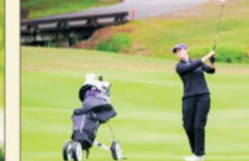
GOLF TRAINING ACADEMY